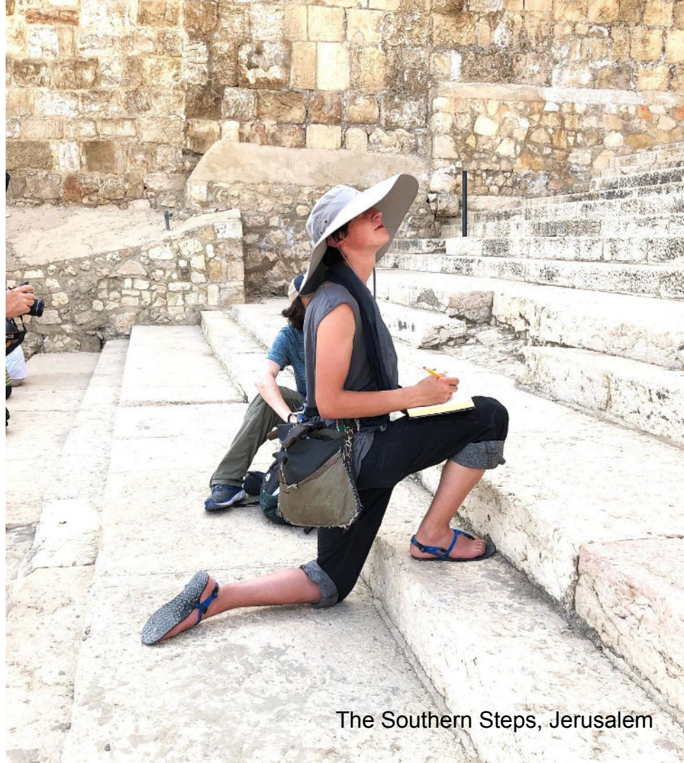
The Southern Steps, Jerusalem