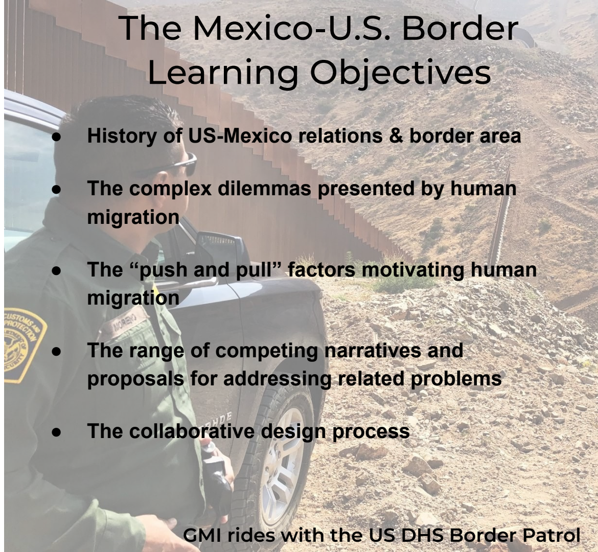
GMI rides with the US DHS Border Patrol